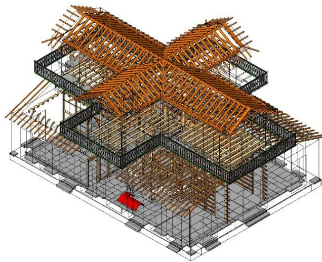
Fig. 4.2: Structural reinforcement. Chalet Condessa d'Edla (Sintra)

Expected impact by 2040: Improvement of the conservation conditions of European cultural heritage with a minimum intervention for, at least, 30 % reduction of heritage loss in Europe. 30 % reduction of repair works. 20 % cost reduction in conservation of cultural heritage. 50% reduction of aggressions to worldwide cultural heritage due to vandalism and violent attacks. Decreasing of international illicit trade and theft by 30 %. New market in cultural heritage preventive maintenance, estimated in 100 million €/year in the EU.