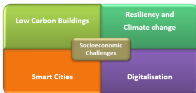
Fig. 4.1: Priority areas in cultural heritage research

Considering the above-mentioned needs, the main topics to be addressed by the Heritage & Regeneration Committee of the ECTP, have been categorized in 9 priorities, divided over 4 themes, and including a transversal area to address socioeconomic needs: