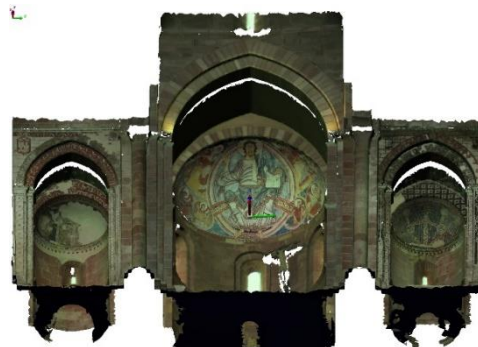
Fig. 3.1: 3D Sta. María de Mave (Palencia)

Moreover, the contribution of Cultural Heritage for better environment should be considered, as it brings environmental benefits and the environmental protection through a reduction in raw materials consumption, pollution and waste, and increased energy saving. However, it should be also considered that climate change may significantly hinder Cultural Heritage.