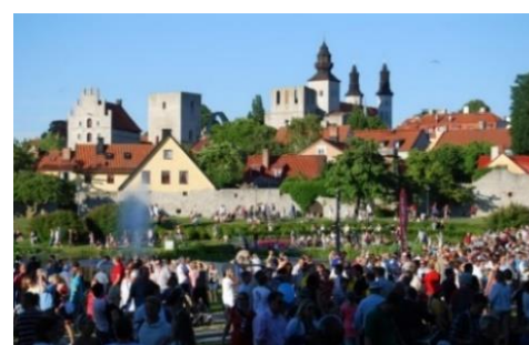
Fig. 4.5: Visby city (Sweden)

Expected impact by 2040: 40 % additional commercial exploitation and real application of innovations arising from research in Cultural Heritage. Better skills and technical knowledge of Cultural Heritage professionals, reinforcing European leadership. Improvement of European SMEs competitiveness in this field and 20 % increase of international activities, due to worldwide leadership.