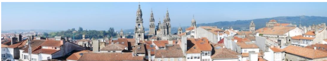
Fig. 2.1: Skyline of Santiago de Compostela

Unlike Latin America or Asia, where big megacities are predominant, Europe is conformed by consolidated small and medium size cities, acting as a network of well interconnected poles. This singularity of European cities is a consequence of the legacy of the ancient city concept. Indeed, according to Habitat III conclusions 7 , only Europe has any tradition of "associating urban policies and territorial cohesion with specific programs that try to build on the role of intermediary or mid and small-sized cities" to ensure high quality of life, while allowing implementation of sustainable urban policies. European cities are particularly characterized by their historic building stock, with more than 40% of it built before 1960, and around 12% with historical value, 73% of these included in urban areas 8 . The rate at which new buildings either replace this old stock, or expand the total stock, is about 1% a year 9 . This means that our present cities should be adapted to the new socioeconomic, environmental and cultural trends, while preserving integrity and authenticity. This enormous challenge, even higher when addressing to Cultural Heritage buildings, can be only tackled by research & innovation.