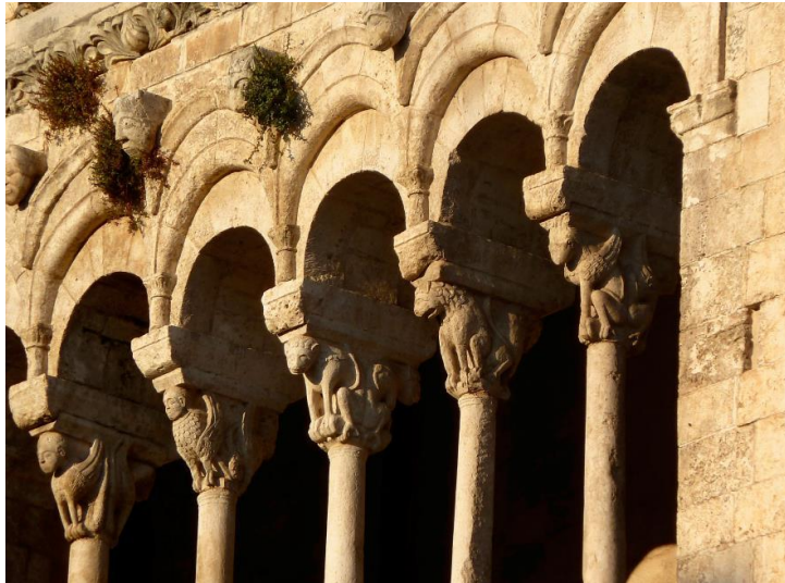
Fig. 5.1: Detail of capitals. Puglia

The development of the research topics mentioned above and their implementation into practice requires an ambitious research program aiming at tackling Cultural Heritage needs. We therefore strongly promote Cultural Heritage research and development in the coming FP9 with all the interdisciplinary fields of research defined above. The cross-cutting approach of Cultural Heritage and its consideration as the fourth pillar of sustainability will considerably contribute to a much broader scope: more prosperity for the citizens and better cohesion within the European society as well as a sustainable future for European cities.