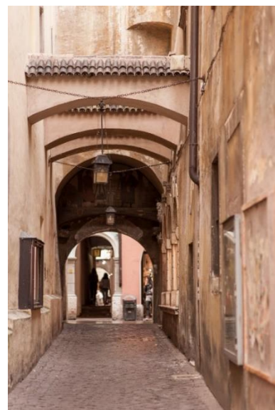
Fig. 4.3: Bolzano city center

Expected impact by 2040: At least, 50 % of the historic city is accessible for elderly and disabled people, including dwellings. Economic revitalization of the historic city up to 10 % through creation of new business. Reversal of the present trend to pull out the historic city and population raise over 10 %. Reduction of vehicle mobility by 20 %, through the recovering of the historic city socioeconomic dynamism.