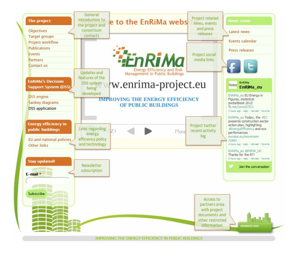
Figure 1 - Screenshot of the EnRiMa homepage