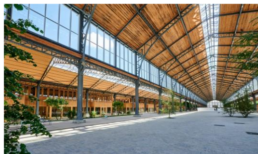
The Fixed Fair will take place at Gare Maritime